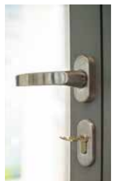
Upgraded Hafi Stainless Steel 253 Handle