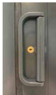
Upgraded Integrated D/pull Handle